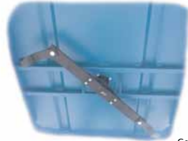
Specially designed hard-wearing Hardened steel blades with offset flute to disperse grass evenly.